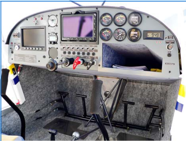
Ergonomic layout of instrumentation and systems enable effortless operation