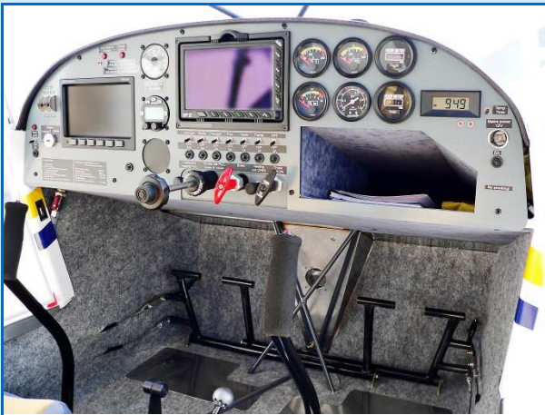
Ergonomic layout of instrumentation and systems enable effortless operation