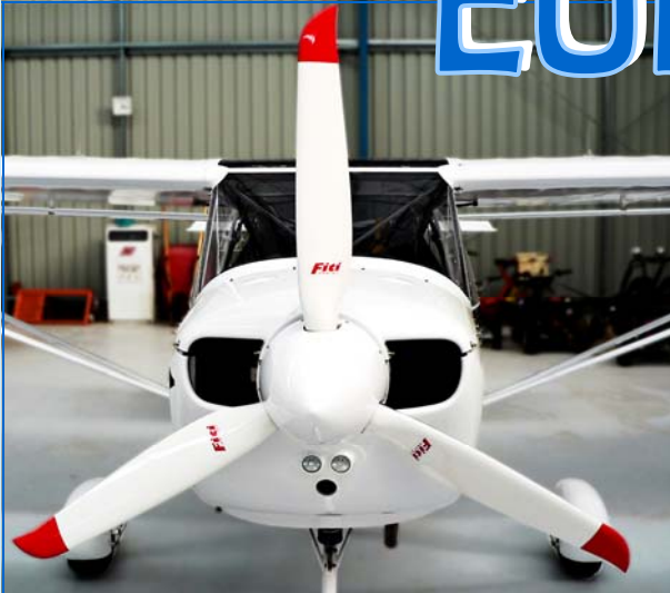
Modern cowling design and Fiti Competition propeller offers generous engine cooling with minimal drag