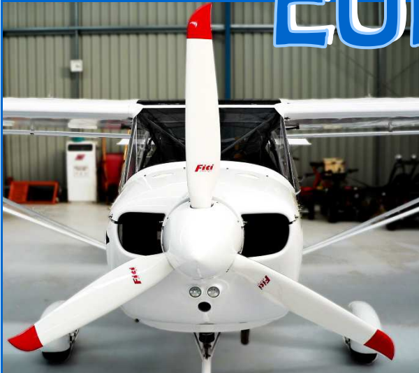
Modern cowling design and Fiti Competition propeller offers generous engine cooling with minimal drag